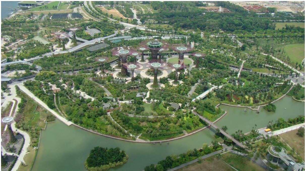
Figure 6. New Developments around lake – Marina Bay Gardens