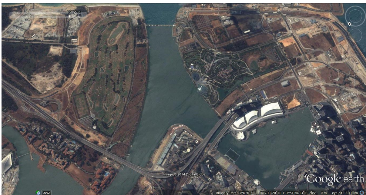
Figure 3. Marina Bay – 2014 Barrage in place