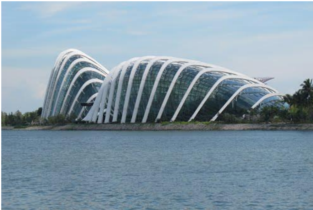
Figure 8. Gardens by the Bay - Flower Dome and Planet Marina