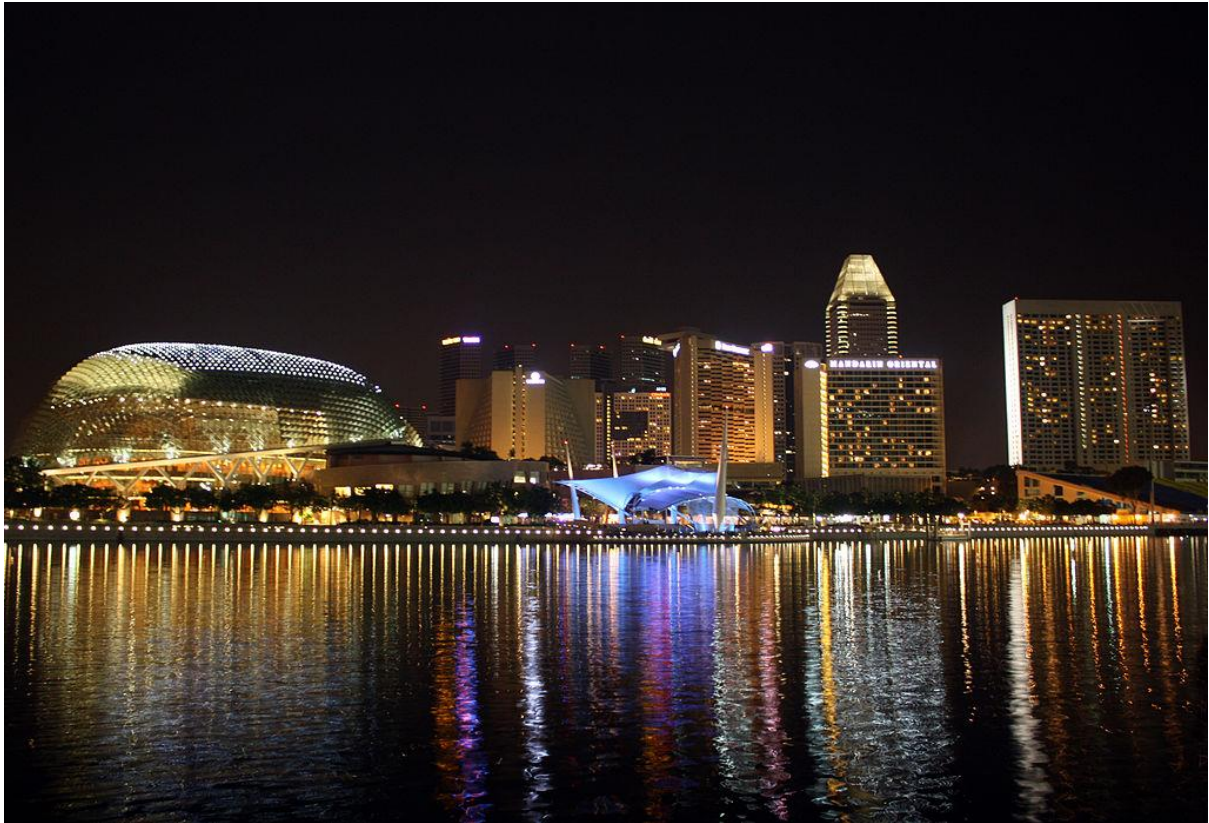
Figure 9. Esplanade Theatres on the Bay