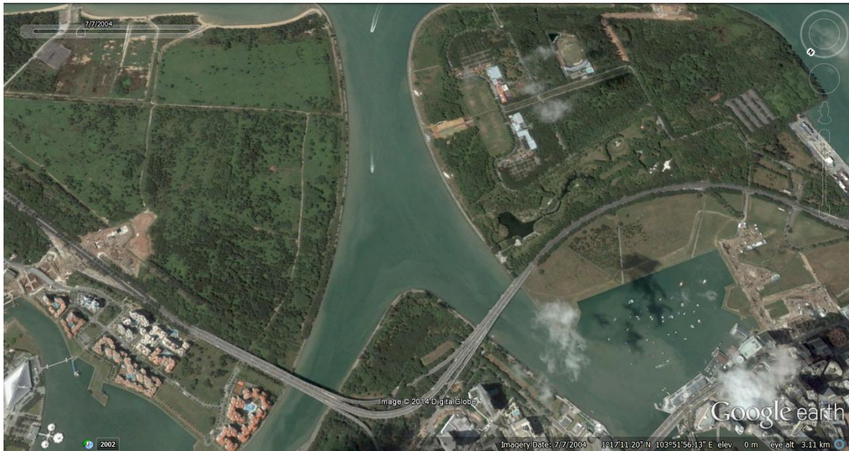
Figure 2. Marina Bay – 2004 – before barrage and lake developments

http://www.pub.gov.sg/Marina/Pages/default.aspx