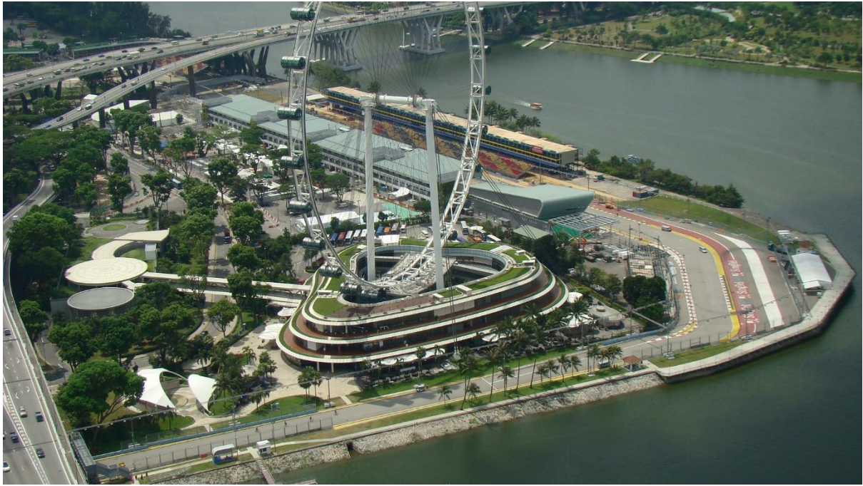
Figure 5- New Developments around lake- formula 1 pits and Ferris Wheel.