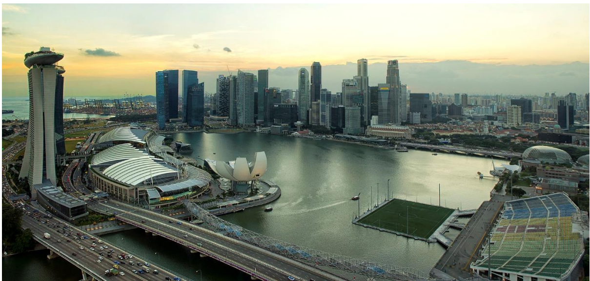
Figure 10. Marina Bay - Marina Bay Sands Hotel, Conference Centre, financial district and amphitheatre