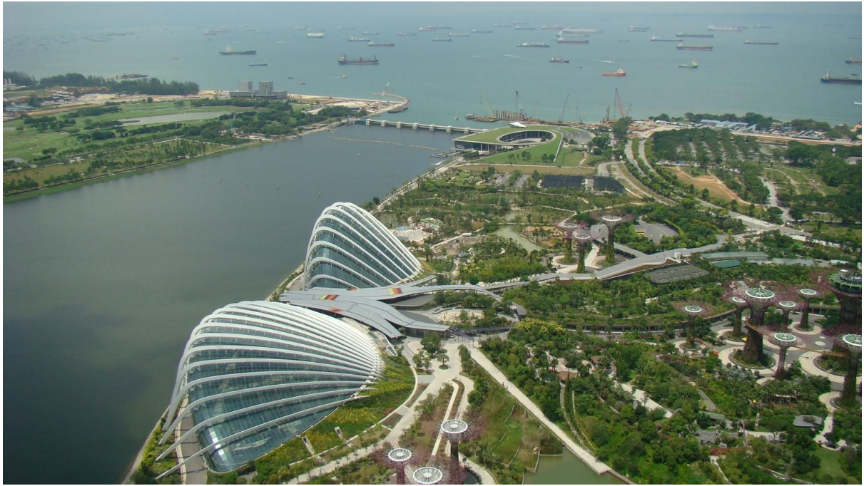
Figure 7. - Gardens by the Bay - Flower Dome and Planet Marina